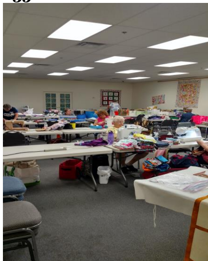
35 th Ave Sew and Vac