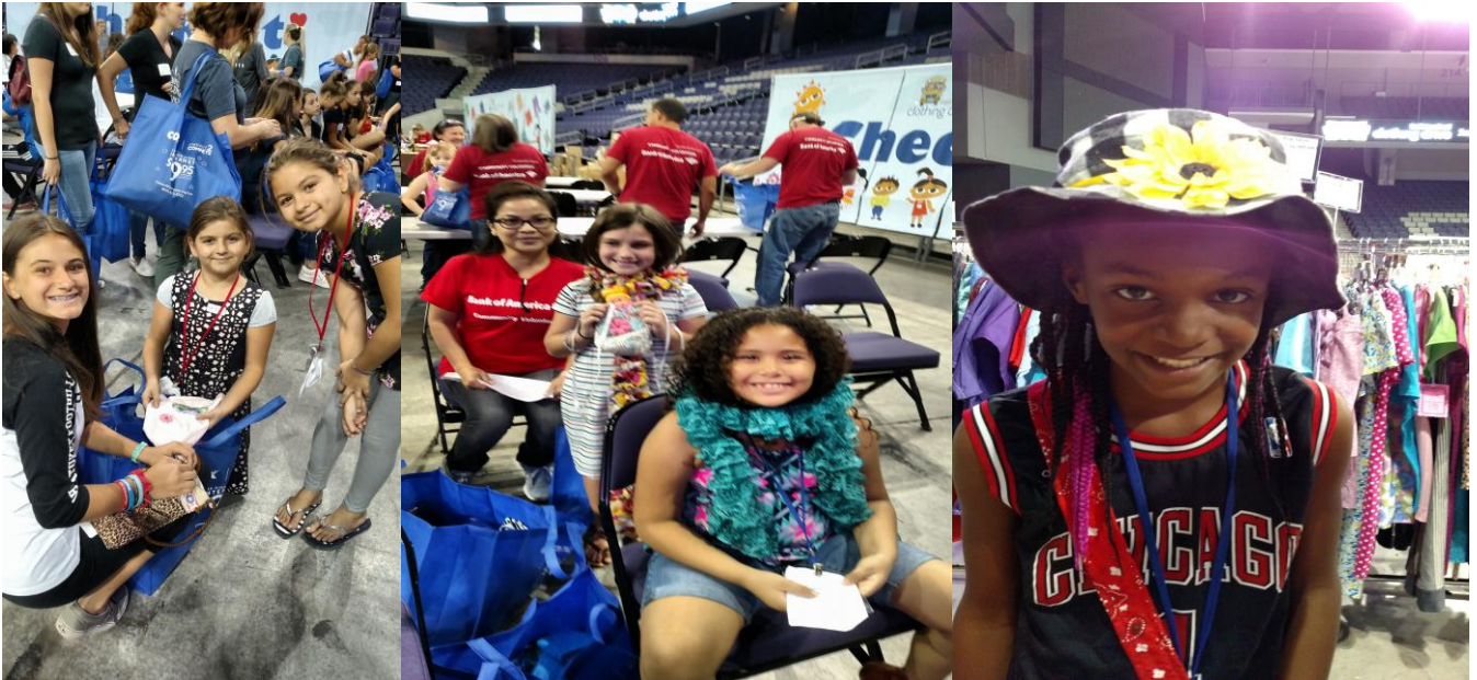
SOME OF OUR VOLUNTEERS