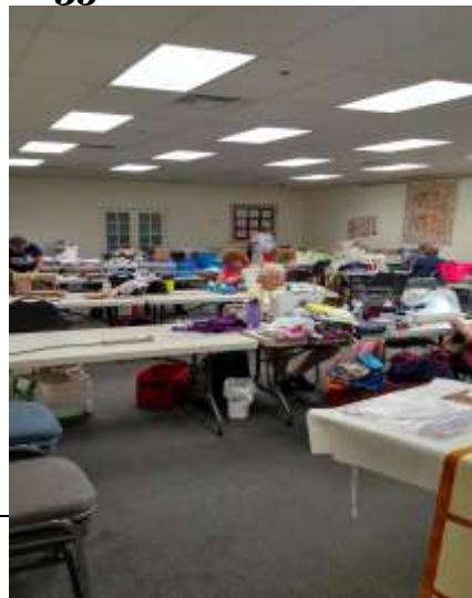
35 th Ave Sew and Vac